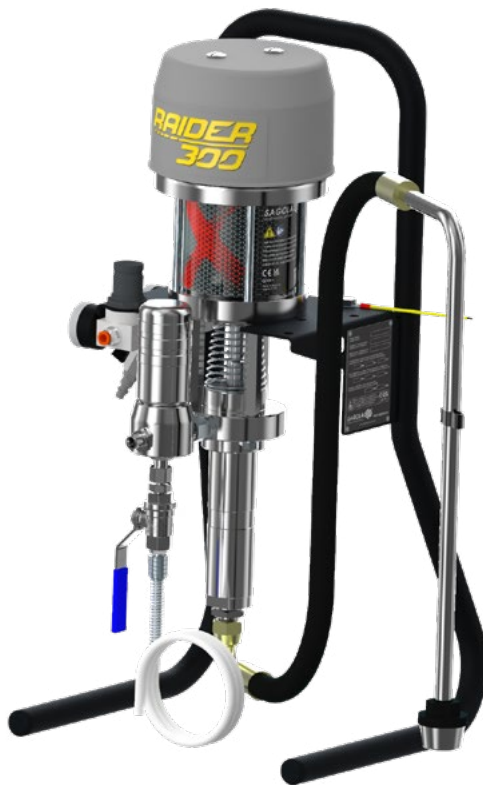
Trolley and absorption version

Within the quality standards we focus on simplicity and durability . Thus, we have redesigned completely the hydraulics. Now it contributes to a long-lasting life even in the worst working conditions and without waiving on its performance.