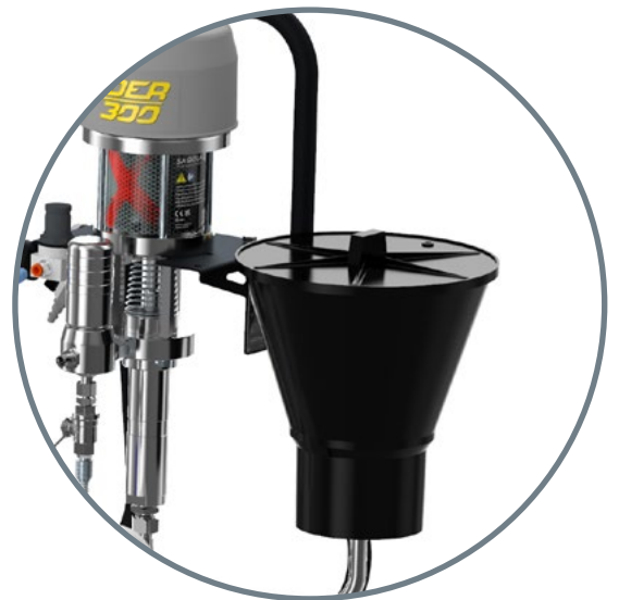
Trolley and deposit version