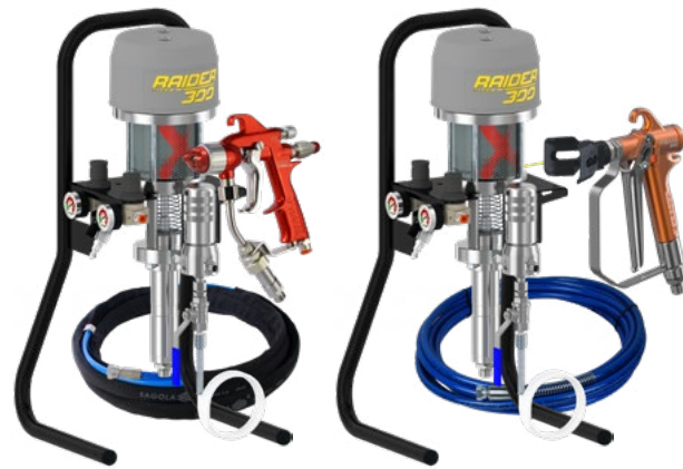
Full equipment RAIDER 300 Mix