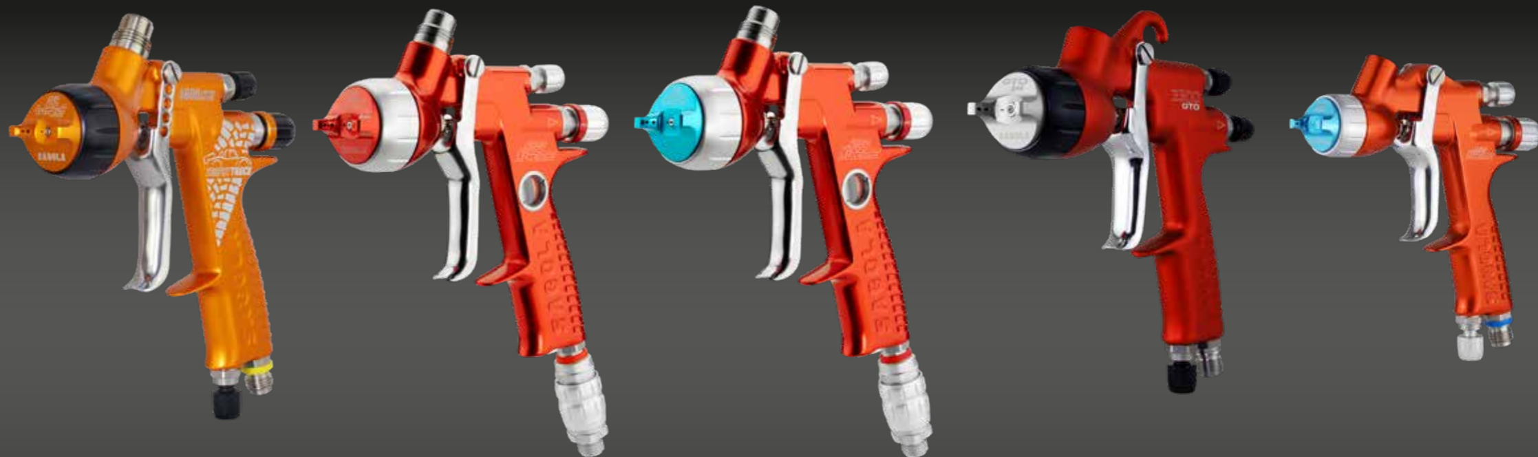
4600 TROPHY TRUCK LIMITED EDITION TITANIA PRO